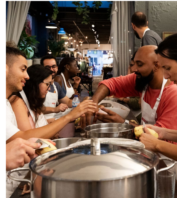
Portuguese Food Workshop