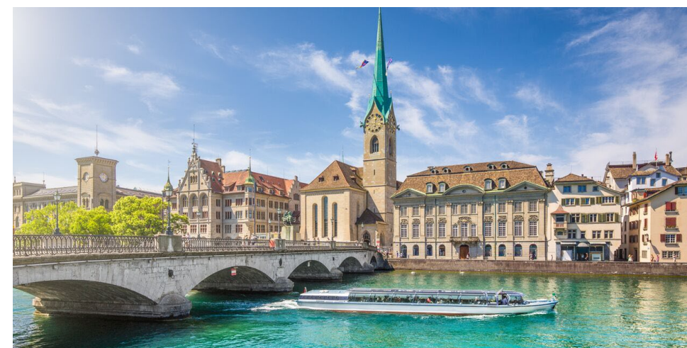
Visit to Zurich