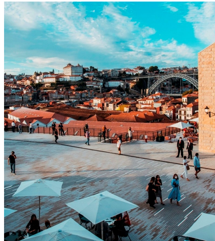
Visit to World of Wine