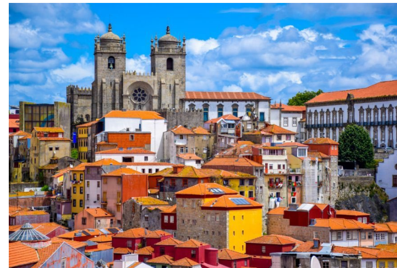
Porto Walking Tour