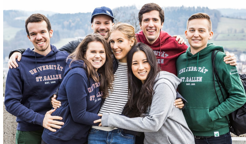
Alumni Networking Events