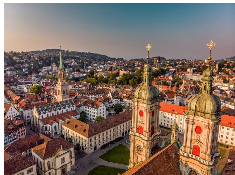
St. Gallen Guided Tour