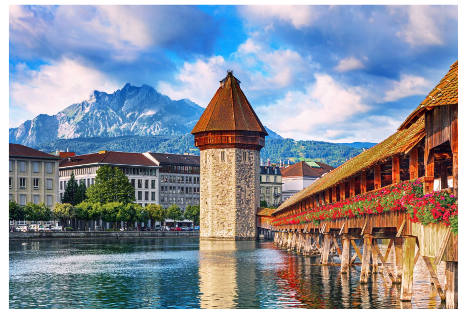
Lucerne City Tour